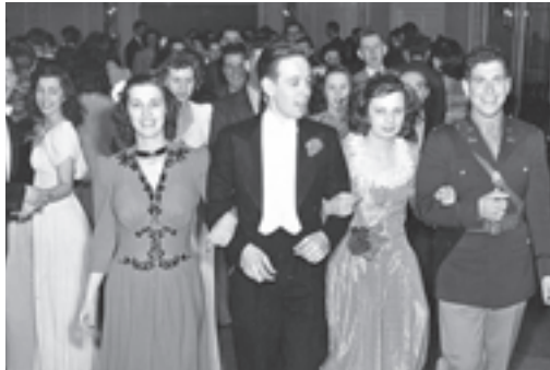
Formal Dance (1944)

Attendance Class Withdrawal Academic Dishonesty Academic Grievances Student Records Academic Probation and Dismissal Honors