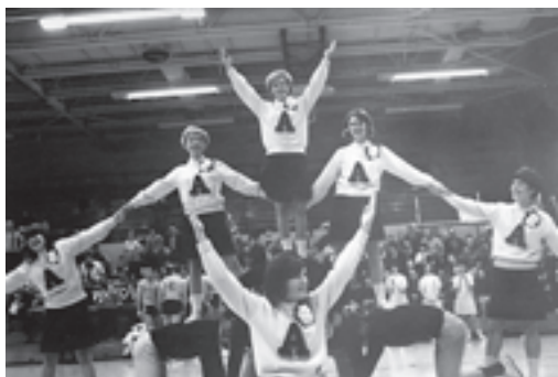
Aquinas College Cheerleaders (circa 1960's)

Student Resources Residential Life Activities and Organizations Policies and Regulations