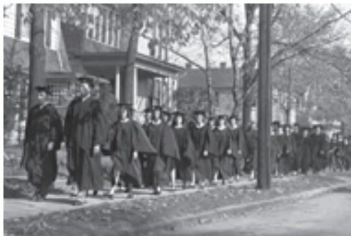
Cap and Gown Day (1948)

Board of Trustees Administration Faculty Adjunct Faculty Emeriti Faculty