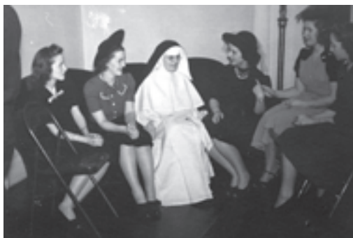
Tea with a Dominican Sister (circa 1940's)

Vision Statement Mission Statement Diversity Statement Integrity Statement Overview Accreditation and History