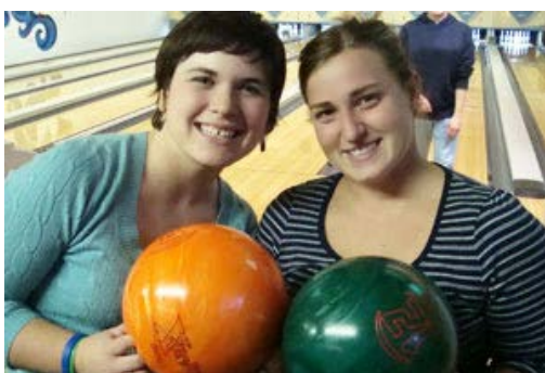
Insignis Mentor Bowling, 2009