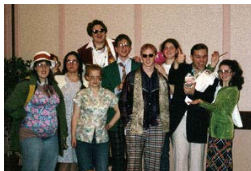
Mid-East Honors Association (MEHA) conference, 1996