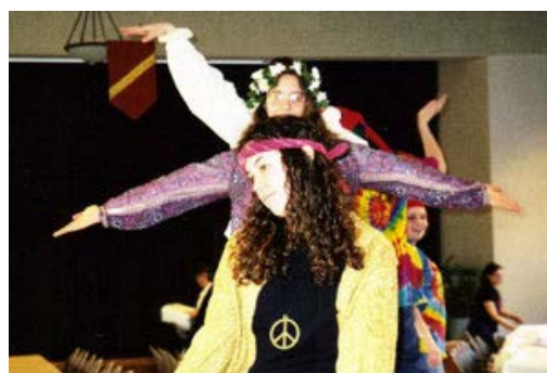
A performance during St. Thomas Aquinas Week, 2000