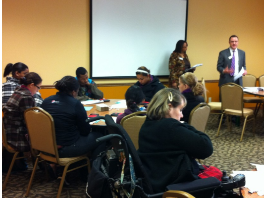
Students listen to a savings presentation by PNC Bank.

The third and final financial literacy workshop presented by Student Support Services for the Fall took place in mid-November. The theme of the day was savings. So, it was only fitting that students were given not one, but two workshops to help teach them better methods of savings.